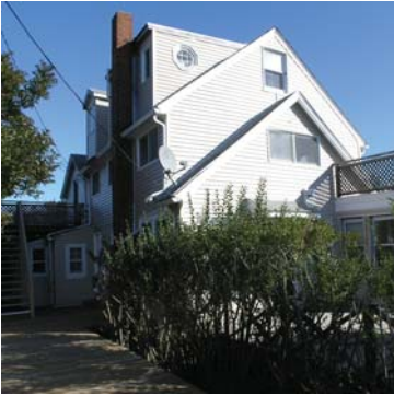
$799,000 - CHERRY GROVE. EAST END NEW ENGLAND STYLE MANOR. 2.5 story retreat is loaded with rooms to spare. 12 Bedrooms, 8 full Baths, full kitchen, and numerous living areas are situated throughout. Outdoor decks on each level.