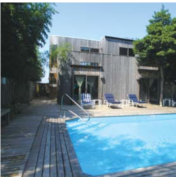
$8,000 - FIRE ISLAND PINES - weekly MAGNIFICENT WATERFRONT CONTEMPORARY. 3 bedrooms, 3 baths. Large loft living area, open floorplan living dining kitchen area, all with exceptional views. Secluded pool area, great privacy.