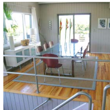
$6,000 - FIRE ISLAND PINES - weekly CONTEMPORARY F.I. PINES EAST END GEM 4 Bedrooms, 2.5 Bathrooms, newly refurbished top to bottom! Large outdoor decks around pool. 2 story lofted and ample foyer. Fabulous water views.