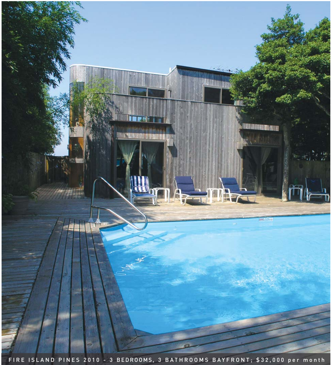
FIRE ISLAND PINES 2010 - 3 BEDROOMS, 3 BATHROOMS BAYFRONT; $32,000 per month