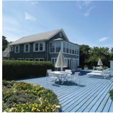
$50,000 - CHERRY GROVE - seasonal NEW ENGLAND BAYFRONT. 5 Bedrooms, 2 full Bathrooms, grand Living-room with wood burning fireplace, den, and a cozy sunroom overlooking the bay. Large deck offers best sunsets and bay views.