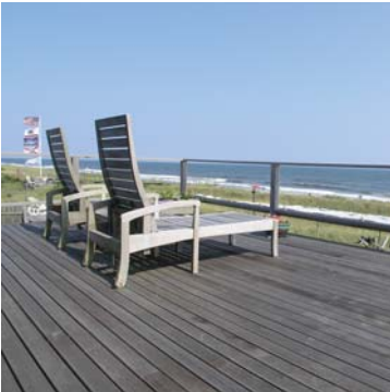
$38,000 - CHERRY GROVE - seasonal INCOMPARABLE OCEAN VIEWS. This gorgeous two bedroom oceanfront has enormous decks on two floors that look onto the Atlantic. The master bedroom opens onto a spacious oceanfront deck.