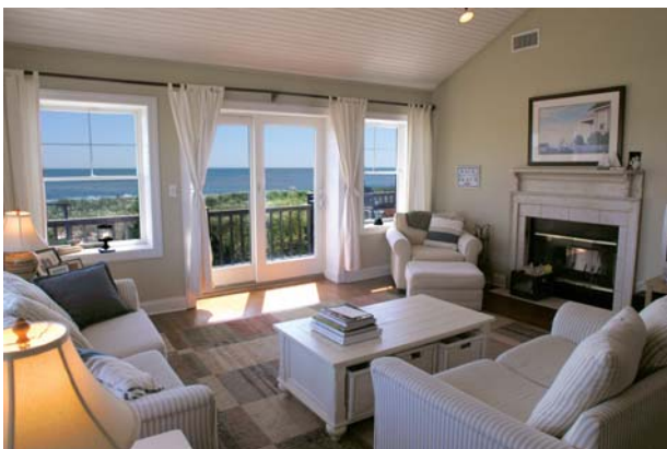
$979,000 - CHERRY GROVE. OCEANFRONT HOME, 4 Bedrooms, 4 Baths, Living-room, Dining-room, full custom kitchen, 2 fireplaces, high vaulted ceilings, central heat and A/C, private decks, full ocean views from Living-room and Master Bedroom. Gardens and pool.