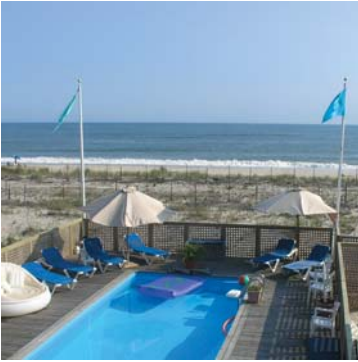
$60,000 - FIRE ISLAND PINES - seasonal OCEANFRONT GEM. 3 Bedrooms, 2 Bathrooms with spectacular ocean views, Living-room/ Dining-room, kitchen areas, all with water views. Large pool & roof deck hot tub.