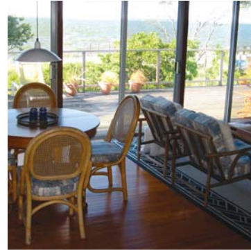
$45,000 - FIRE ISLAND PINES - seasonal BAYFRONT BEAUTY. Secluded west end of the Pines, bay front home with spectacular sunset views. 3 Bedrooms, 2 full Bathrooms with open living dining and kitchen areas provide great views of the bay.