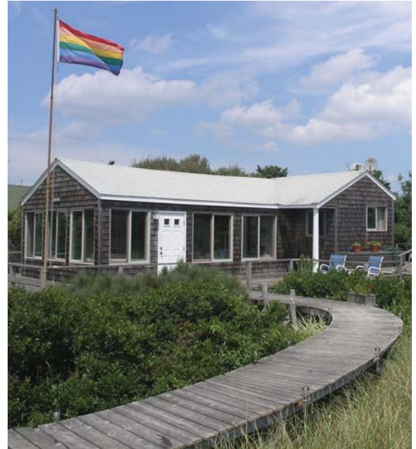
$795,000 - CHERRY GROVE. PRISTINE & BEAUTIFUL SUMMER HOME. West end 2 bedrooms, 1 bath bungalow, recently renovated - an incredible gem on the edge of town, incredible views of the National Seashore. Meticulously redesigned, updated and maintained.