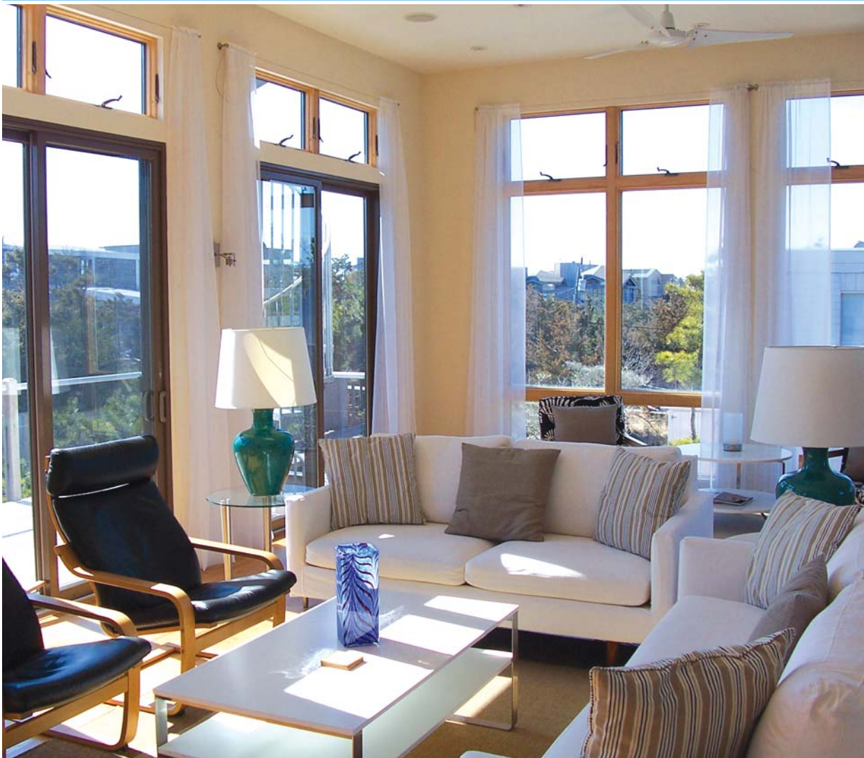
$1,600,000 - FIRE ISLAND PINES. FABULOUS NEW CONSTRUCTION (2007). 4 Bedrooms, 4.5 Bathrooms. Large Living-room/Dining-room with fireplace, central AC, heated pool, hot tub, outdoor shower and roof deck with amazing views. Gourmet style kitchen with stainless steel appliances.