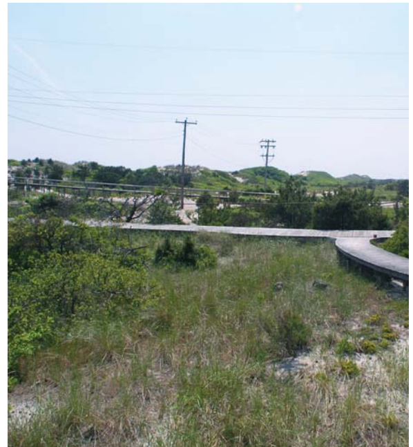
$449,000 - CHERRY GROVE. LAND, SECLUDED LOCATION. Great Location! Situated on the last walk in the west end of Cherry Grove, has Unobstructed views of the National Seashore parklands, dunes. Park lands to remain open, views will always be unobstructed.

FIRE ISLAND OFFICE: Corner of Bayview and Ocean Walks, Cherry Grove, N.Y. 11782 - 631.597.3100 WWW.ELLIMAN.COM/FIREISLAND