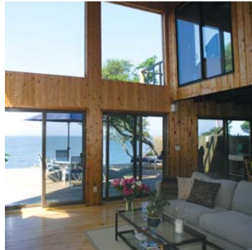
$32,000 - FIRE ISLAND PINES - monthly BEAUTIFUL BAYFRONT. 3 bedrooms, 3 baths with exceptional bearing on the water's edge. Large loft living area, floor to ceiling windows, open floorplan living dining kitchen area. Secluded pool area.