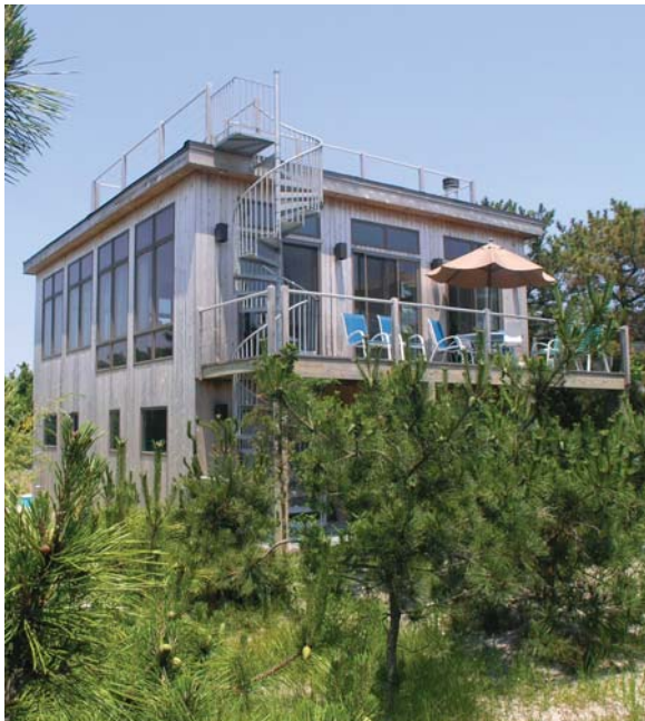
$1,600,000 - FIRE ISLAND PINES. FABULOUS NEW CONSTRUCTION (2007). 4 Bedrooms, 4.5 Bathrooms. Large Living-room/Dining-room with fireplace, central AC, heated pool, hot tub, outdoor shower and roof deck with amazing views. Gourmet style kitchen w/stainless steel appliances.