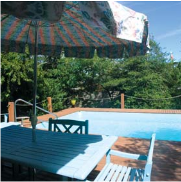
$579,000 - CHERRY GROVE. MAGNIFICENT SUMMER BUNGALOW. Traditional 2 Bedrooms, 1 Bathroom bungalow - exceptionally maintained, with large property and large solar heated pool. "Winter Water" and to be sold furnished.