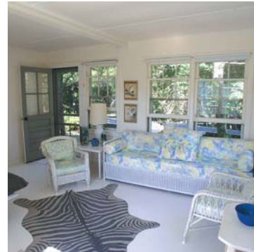
$24,000 - CHERRY GROVE - seasonal SERENITY AT THE BEACH. Enjoy the comfortable calm of this beautiful 2 bedroom 1 bathroom home, with large open living areas, full kitchen, outdoor decks, and gardens. Outdoor shower.