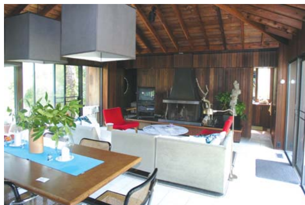
$875,000 - FIRE ISLAND PINES. HORACE GIFFORD DESIGNED HOME. Beautifully appointed, private and secluded location, 3 Bedrooms, 2 Baths with a solarium overlooking the garden. Open-living floorplan style main room, Living/Dining and Kitchen with large fireplace. Beautiful Spa!

FIRE ISLAND OFFICE: Corner of Bayview and Ocean Walks, Cherry Grove, N.Y. 11782 - 631.597.3100 WWW.ELLMAN.COM/FIREISLAND