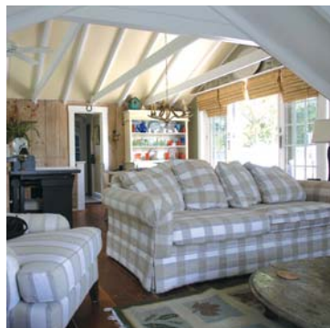
$17,000 - CHERRY GROVE - seasonal BEAUTIFUL HISTORICAL SUMMER BUNGALOW. 2 Bedrooms 1 Bath beach residence. Renovated to maintain the charm in which the house was designed for originally, manicured gardens.