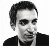
The Times Journalist Too Big To Fail

The Key to Meryl Streep's Fantastic Fox Growl?