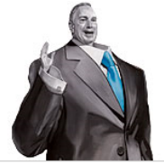
Bloomberg's New Political Challengers